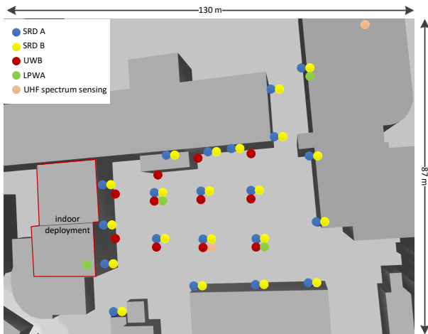
Fig. 3. Locations of available testbed devices in outdoor environment.

The diversity of types, the relatively high number and density of testbed devices, and the possibility of hosting multiple radio technologies in most devices to transmit/receive/sense at the same time at the same location enables experimentation scenarios in a very dense and heterogeneous wireless environment. The various types of experiments include: (i) investigation of assisted and non-assisted indoor/outdoor radio localization algorithms; (ii) spectrum sensing for dynamic spectrum access and cognitive radio networking; (iii) link and/or network performance evaluation in a controlled interference and/or heterogeneous radio environment; (iv) design and evaluation of new custom-developed wireless protocols and their benchmarking against standardized protocols; and (v) performance evaluation and controlled piloting of prototype IoT devices.